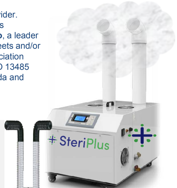
Dry Fog Machines